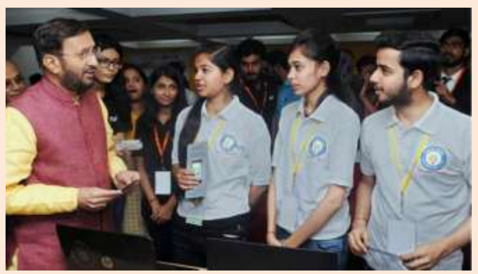
Smart India Hackathon 2018.

The two runner-ups were won cash prizes of Rs 75,000 and Rs 50,000 respectively.