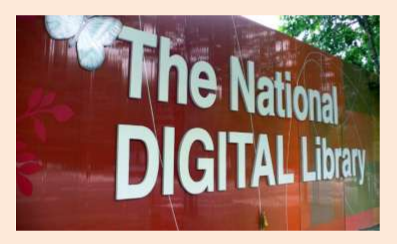
Books to be made available free of cost, even as copyright challenges remain.

https://www.sundayguardianlive.com/news/national-digital-library-aims-add-3cr-users-year