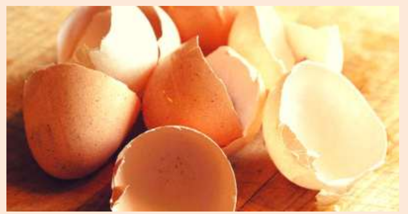
The humble eggshell, can become a source of power, claim researchers at IIT Kharagpur.

According to researchers, eggshell membrane proteins have piezoelectric properties, allowing them to produce electricity under mechanical stress. Non-toxic and bio-compatible, bio-inspired piezoelectric materials are considered an excellent energy harvesting source, which can give our energy deficient world enough power, without increasing environmental pollution.